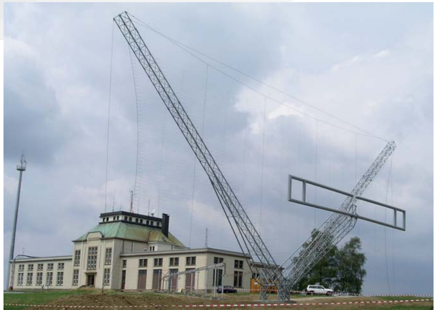
AHR 1/1/0.2 Rigid Dipole Antenna

Behind every great signal-on-air is a well-designed antenna. Thomson offers a variety of antennas to fit a wide range of customer needs.