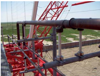
RF Feed line and catwalks

The Thomson Rigid Dipole Technology combines design principles as implemented in rotatable shortwave antenna systems with all the advantages of curtain antennas. The resulting integrated system consists of folded