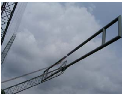
View of the dipole