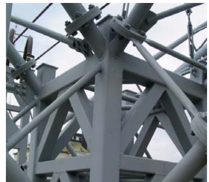
View of central support structure

The components of the rigid dipole antenna are easily accessible. The system maintainability is greatly simplified due to the fact that the antenna has no moving parts, like halyards, steel ropes, counterweights etc.